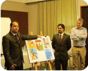
Students at a workshop