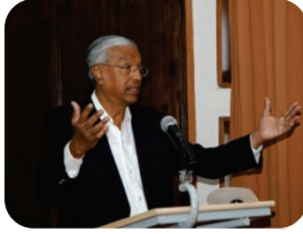
Ashok Ganguly, Former Chairman, Hindustan Lever, Director Unilever; Member Rajya Sabha