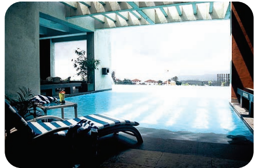
Fully equipped clubhouse