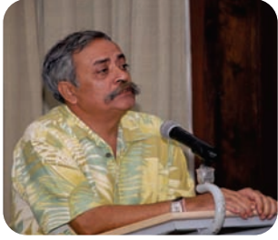
Piyush Pandey, Chairman, Ogilvy