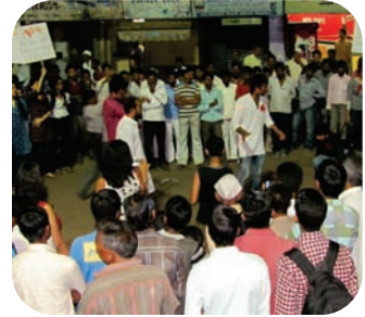
Aids awareness campaign